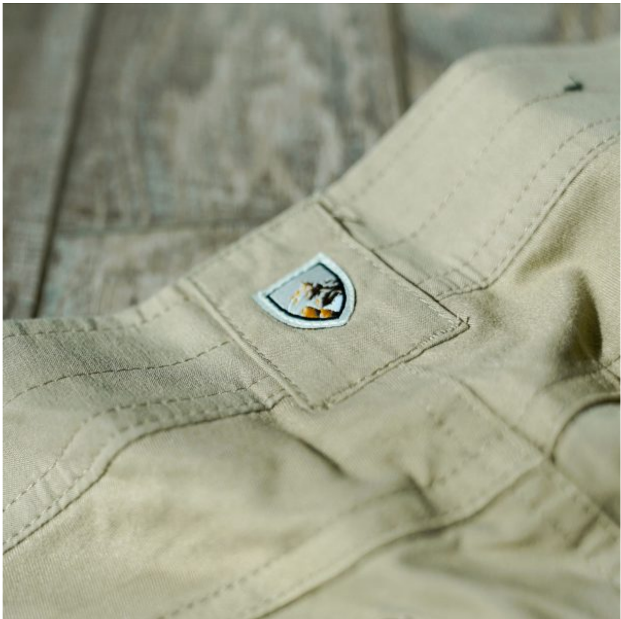
Rear waistband yoke with stretch panel

KUHL produces two versions of the RADIKL fit...Klassik (as I have on test), and a tapered version for a slightly more streamlined, modern fit. The Klassik is a pretty 'standard' fit in my opinion...you're not swimming in a pair of dad jeans, but you're also not looking like you might burst at the seams.