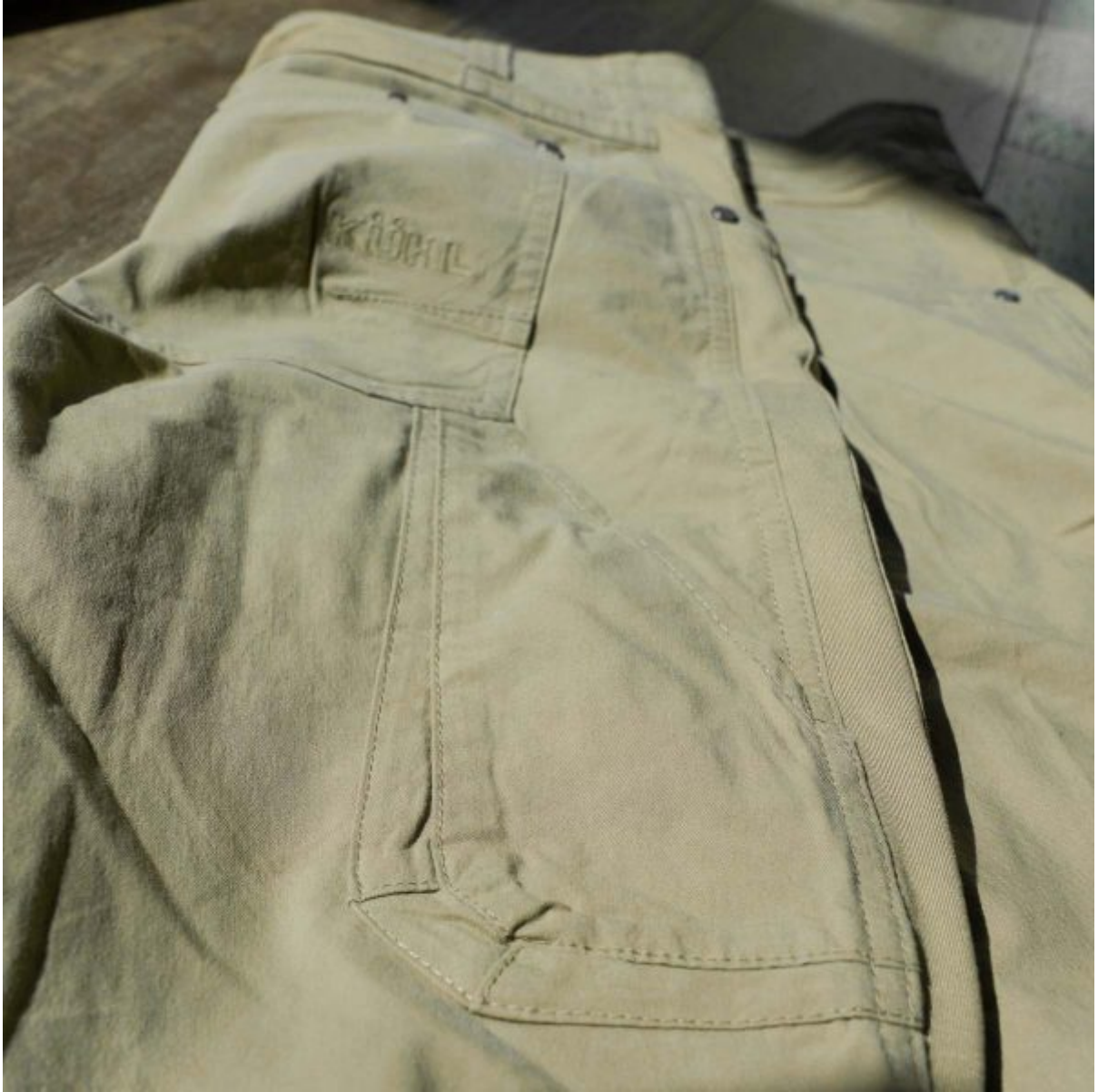
3D gusseted pocket