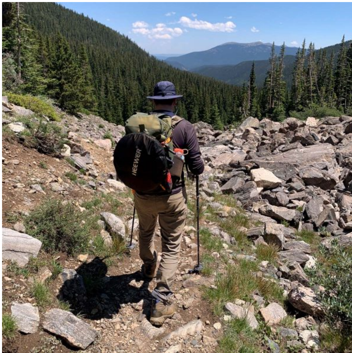
The Kuhl Radikl Pants in action

KUHL designed the RADIKL to be ultra-durable and I feel like they've nailed it. KUHL uses their lightweight and durable Enduro Performance Blend Fabric for the majority of the construction of the RADIKL and it does a great job living up to its name. Being a blend of cotton, nylon, and spandex, the Enduro fabric breathes well while providing ample doses of abrasion resistance. I can attest to this as I spent a decent amount of time sliding booty first down some steep shale slopes near Whale Peak in Colorado. The pants laughed at the sharp edges of the rock even if my backside was less than enthused.