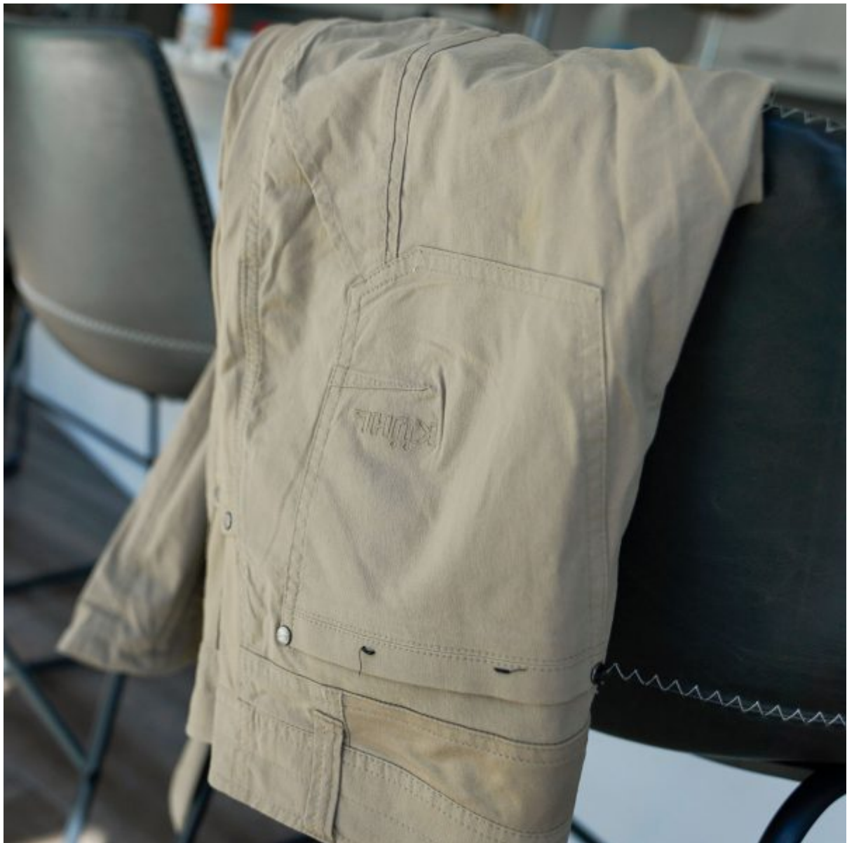
Back pocket with rear waistband yoke

I touched on how lightweight and breathable the pants are above, but I can't stress this enough. If you've spent any serious time in the backcountry, you probably already know that some of the uber-durable clothing out there might not always lean into comfort and lightweight as a core attribute. KUHL went out of their way to ensure all-day comfort with the RADIKL while also being tough as nails and a go-to for outdoor activities.