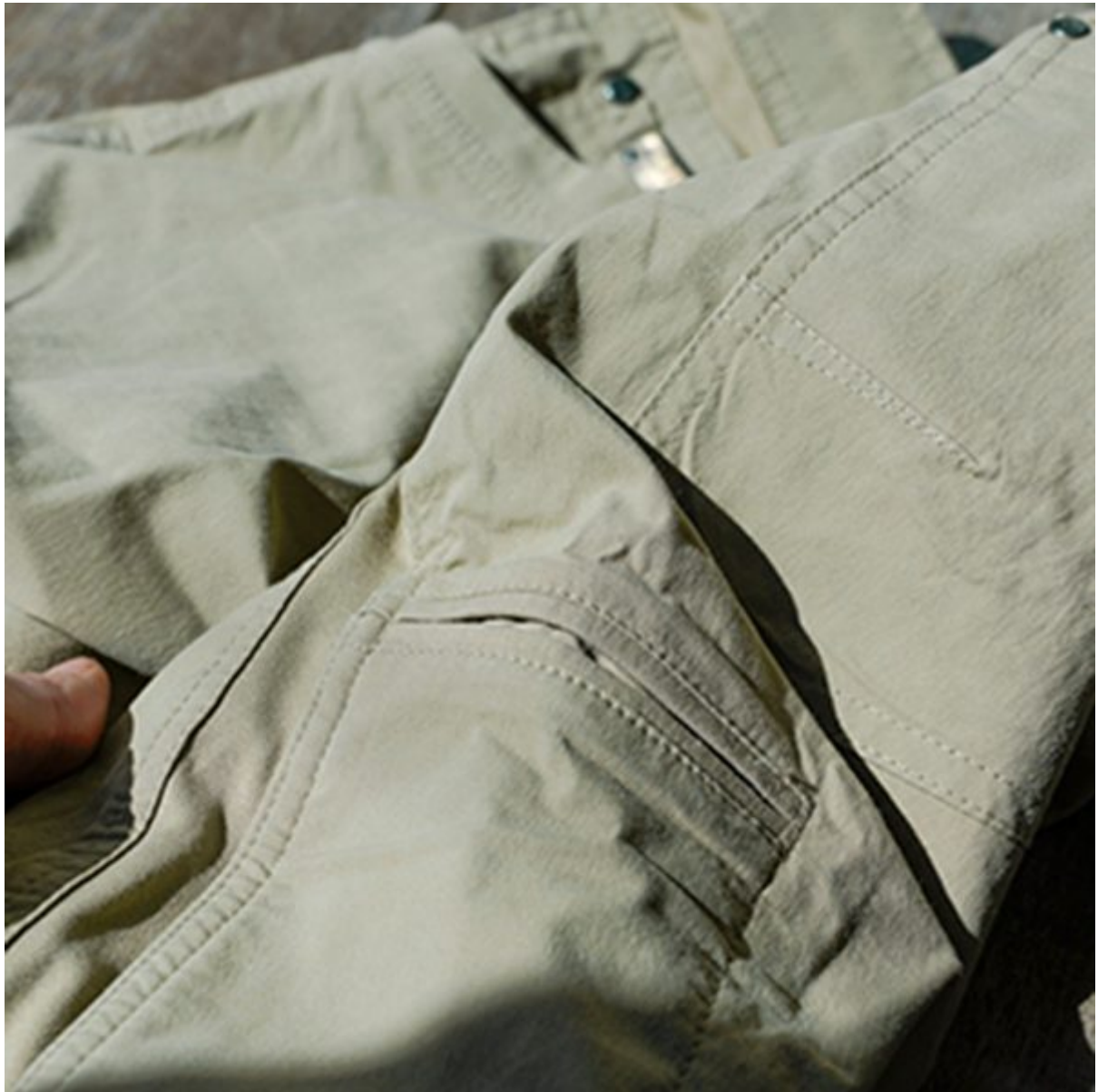
Hidden cell phone pocket

SEVEN POCKETS! Two front standard jean pockets, one coin pocket, two back pockets, one stealth cell phone pocket, and one 3D gusseted pocket. So yeah, you can carry all the things!