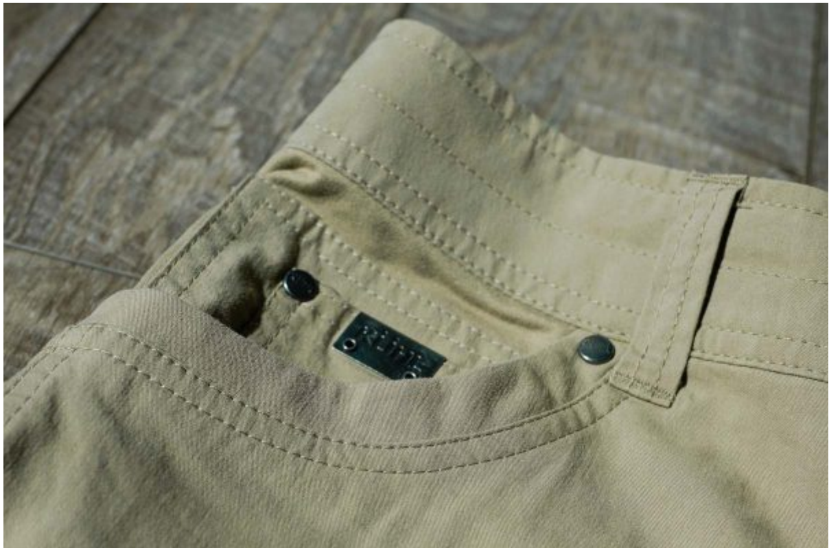
Front pocket with coin pocket

KUHL claims the RADIKL is a quick-drying pant. I'm not sure I'd consider it that, however. The RADIKL does a lot of things well, but as for being quick-drying the cotton content of the main fabric limits that a bit. So for those of you looking for a pant to do some serious backcountry missions, you might want to find something with a bigger synthetic content as getting and staying wet can be, on the low end, annoying. And on the high end, downright dangerous.