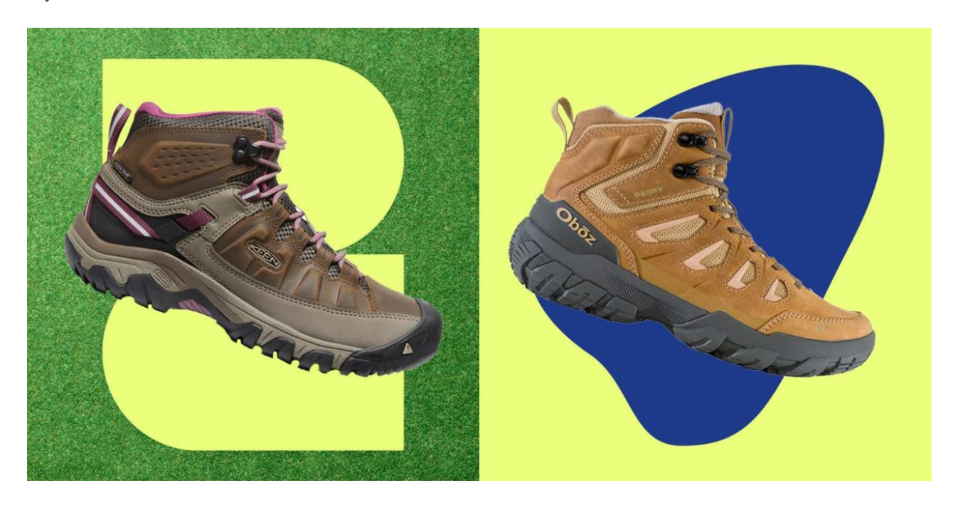
The 6 Best Hiking Boots For Women, TestedHearst Owned

"Hearst Magazines and Yahoo may earn commission or revenue on some items through these links."