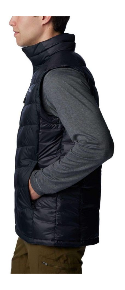
1 / 8 Columbia Labyrinth Loop Vest